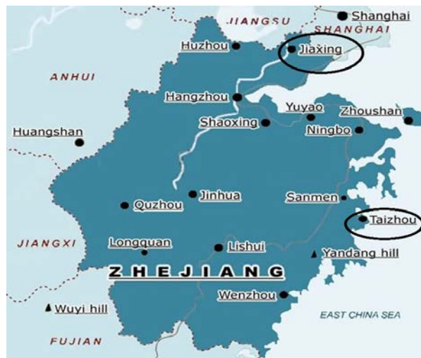
Figure 2. Map Zhejiang

Second, Jiaxing and Taizhou are located in the northeast and middle of Zhejiang, respectively (see Figure 2), and are two of the most developed cities in Zhejiang. They have parallel GDPs and marketization levels. We chose these two cities to control for the general development status and performance of farmer cooperatives with a limited differential. The areas of Taizhou and Jiaxing are approximately 9,400km 2 and 4,000 km 2 , respectively. There are more than 7,000 farmer cooperatives in Taizhou and more than 3,000 farmer cooperatives in Jiaxing.