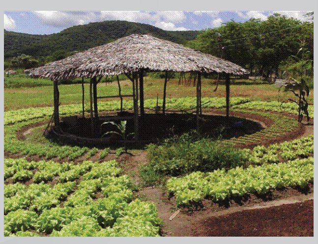
Building capacity with smallholder farmers through a multi-sector partnership in Alagoas, Brazil